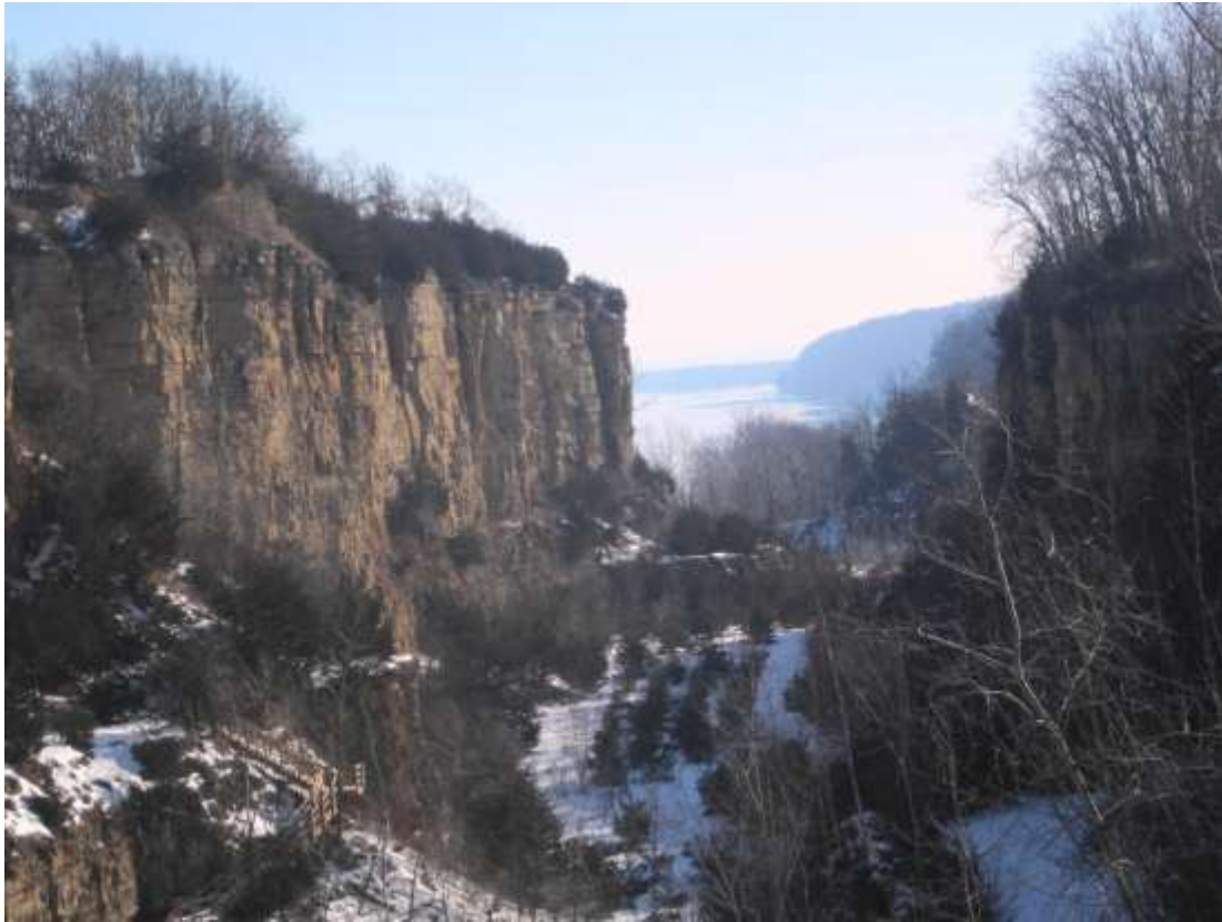
Horseshoe Bluff, overlooking the mighty Mississippi