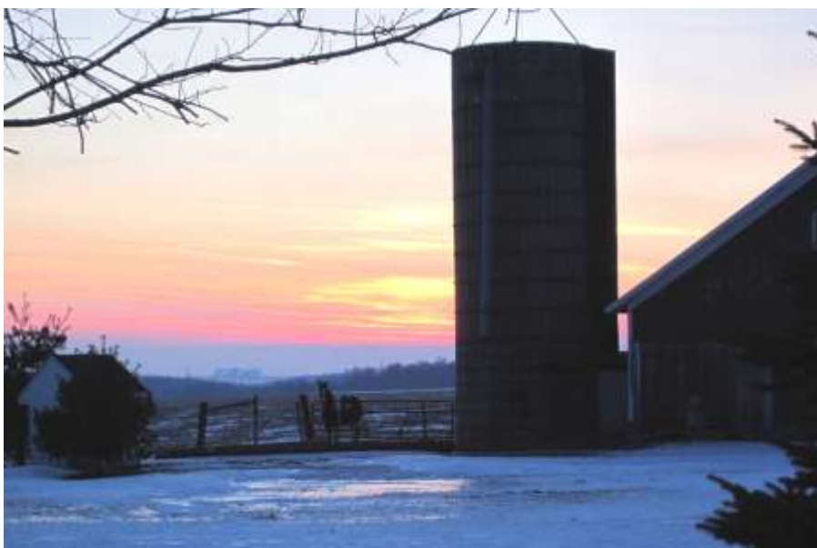
Galena countryside sunset