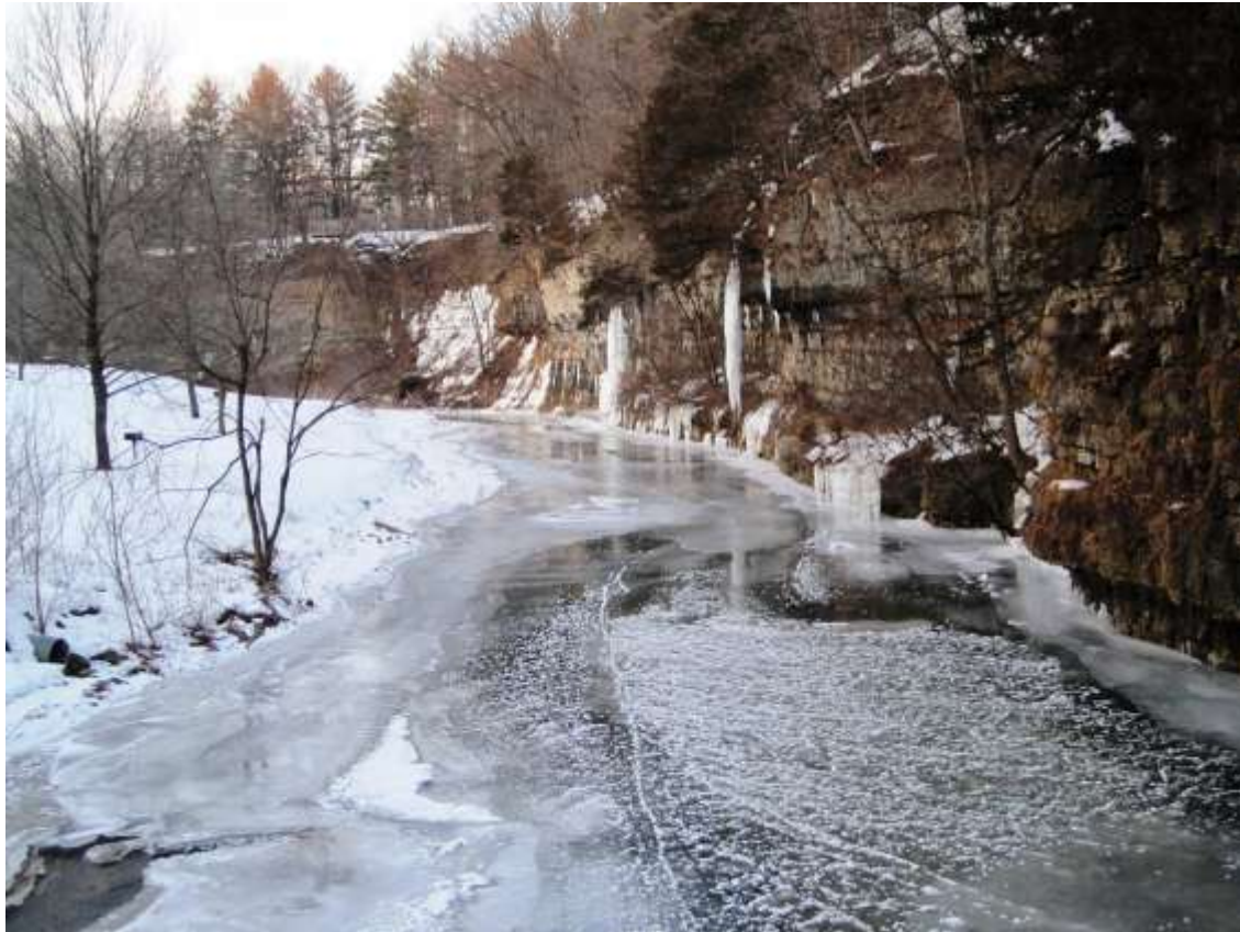
Apple River Canyon